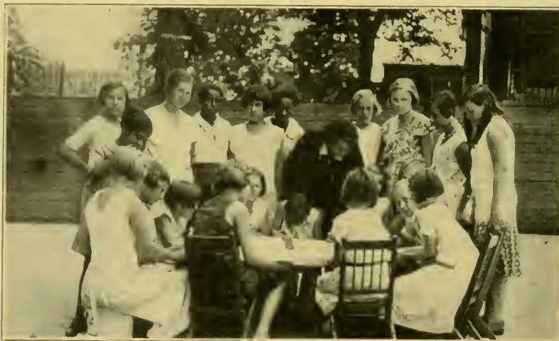
A Quilting Class at the Lutheran Settlement House in Philadelphia